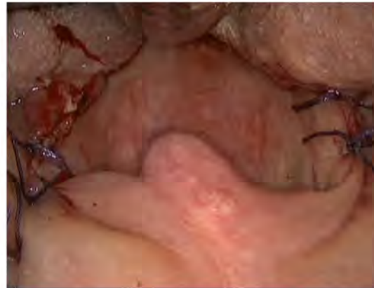
Coblation-assisted Partial Epiglottectomy

Coblation-assisted Midline Partial Glossectomy