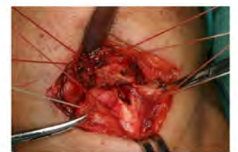
Paediatric OSA surgery